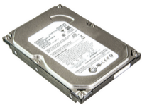
46925.030 - Professional HDD SATA 3,5in 3TB f/DVR