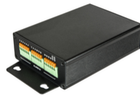
46936.001 - USB alarm extension