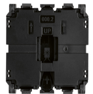
30012.2 - 1P 10AX 2M axial reversing switch mech.