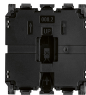
30008.2 - 1P NO 10A 2M axial button mechanism