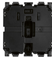
30008.2 - 1P NO 10A 2M axial button mechanism