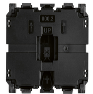
30012.2 - 1P 10AX 2M axial reversing switch mech.