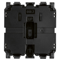
30012.2 - 1P 10AX 2M axial reversing switch mech.