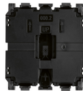
30008.2 - 1P NO 10A 2M axial button mechanism