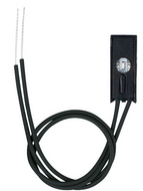
00943.W - Linea 110-250V white LED unit