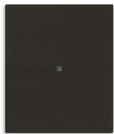
30004A.2G - Axial 1P 10AX 2M 2-way switch black