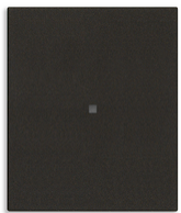
30000A.2G - Axial 1P 10AX 2M 1-way switch black