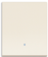
30000.2C - 1P 10AX 2M 1-way switch in-line canvas