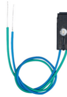
00945.G - Linea Quid LED unit green