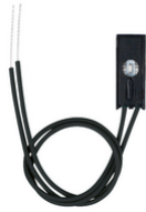
00943.W - Linea 110-250V white LED unit