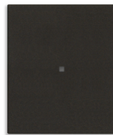
30012A.2G - Axial 1P 10AX reversing switch 2M black