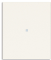
30008A.2B - Axial 1P NO 10A button 2M white